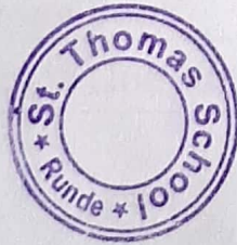
PRINCIPAL St. Thomas School, Runde